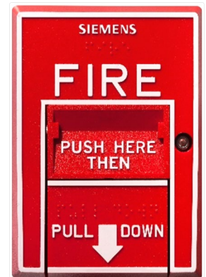
Model HMS-D | -DZ Dual-Action Station

The Model HMS-series manual fire-alarm boxes derive their power, communicate information and receive commands over a single pair of wires. Each box is compatible on the same circuit with all Model ‘H’-series detectors, interfaces or addressable, conventional zone modules.