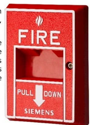
Model HMS-S | -SZ Single-Action Station