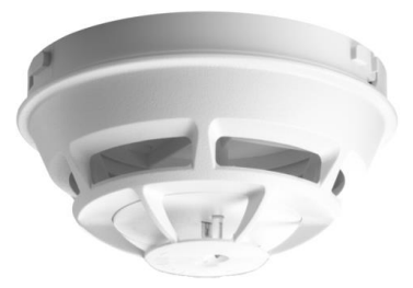
Thermal (Heat) Detector

Each Model HI921 detector has seven (7) pre-programmed parameter sets that can be selected by the Siemens FACP.