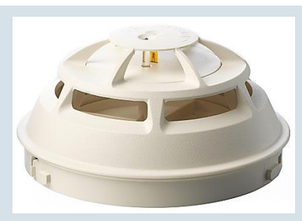
Thermal (Heat) Detector

NOTE: Each detector consists of a dustresistant chamber, a solid state, functional internal sensor, and microprocessor-based electronics with a low-profile plastic housing.